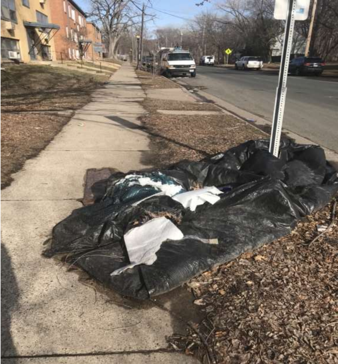
1425 7 th St E – photos and image 4-18-22