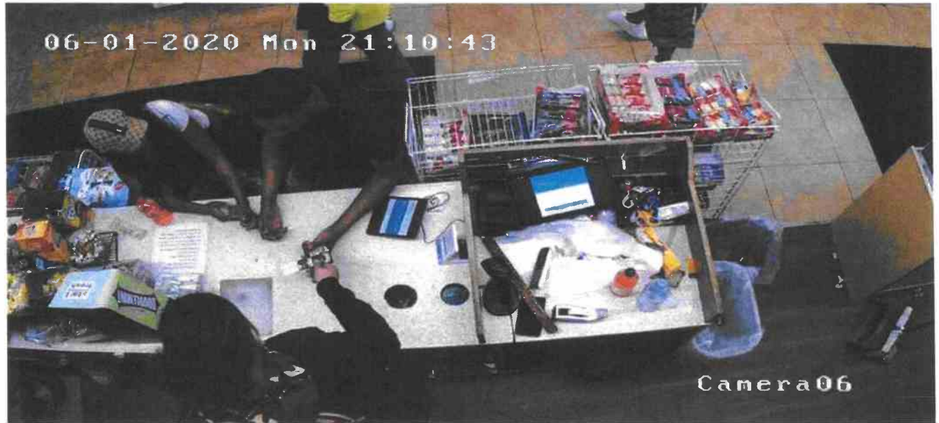
EXHIBIT tabbles® 2-102