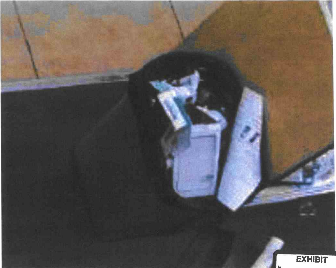
'Backwoods' Stout Cigars