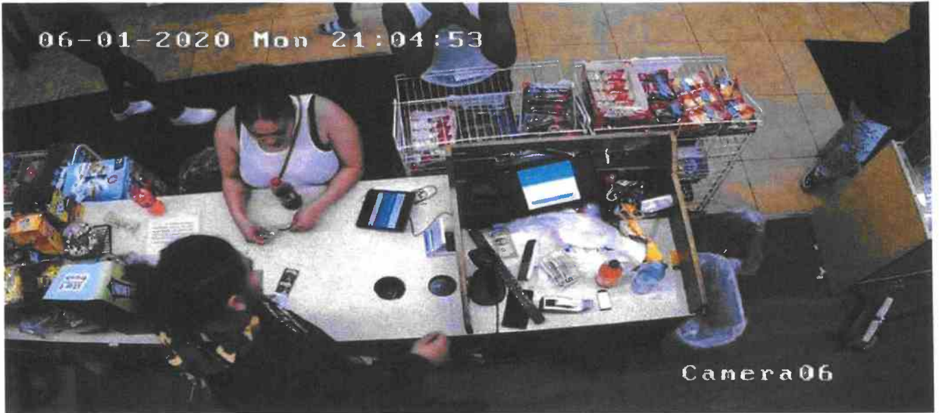
Selling single cigarettes 'Loosies'