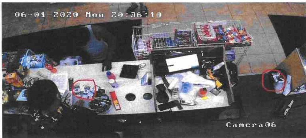
EXHIBIT tabbics® 2-99