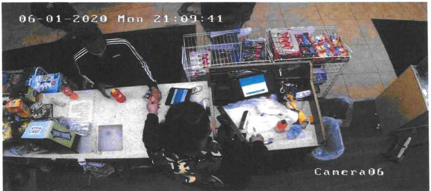
EXHIBIT tabbles 2-101