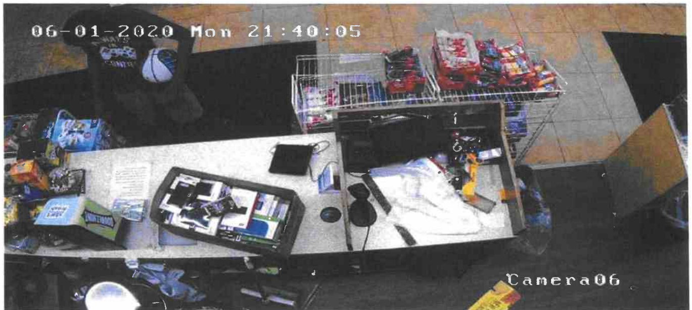
EXHIBIT tabbies® 2-103