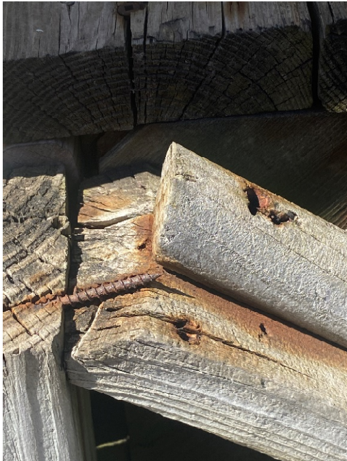
Example of split and loose hand rail

Generally, the quality of construction is also poor. Members are attached without light gage clips, bases, or hangers and the attachment to the home is by screws through the siding.