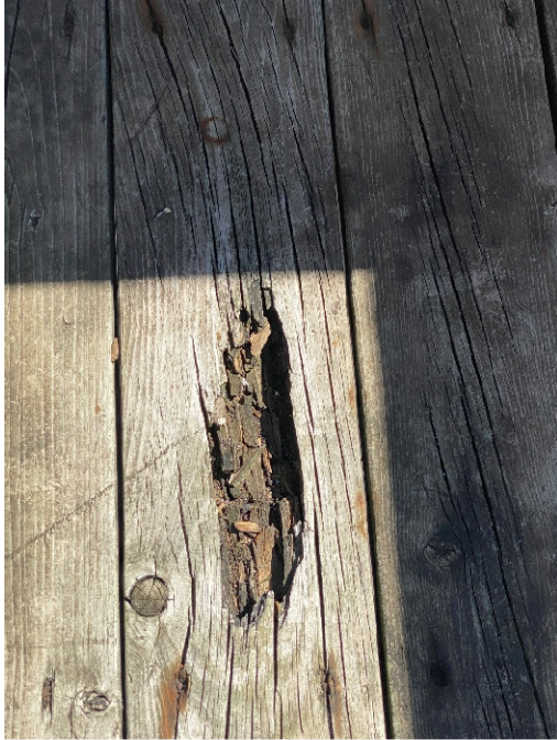
Example of deteriorated floor board