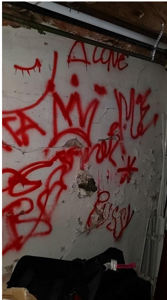
Figure 1: Parge Coating at End of Life (Delaminated)